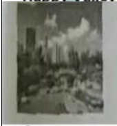
Shanghai Xin Hongqiao Center Garden

The garden was built in September 2000. It covers an area of 130 thousand square kilometers. There are many kinds of green trees and beautiful flowers. It is a good place for taking a walk or having a picnic.