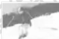
Damingshan Mountain Ski Park